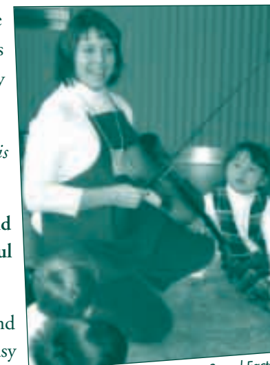
Volunteer Guide with children at Sound Factory.

You can join this group of dedicated WAMSO volunteers who introduce more than 6,000 preschool-age children to Orchestra Hall each year. Call 612-371-5654 today!